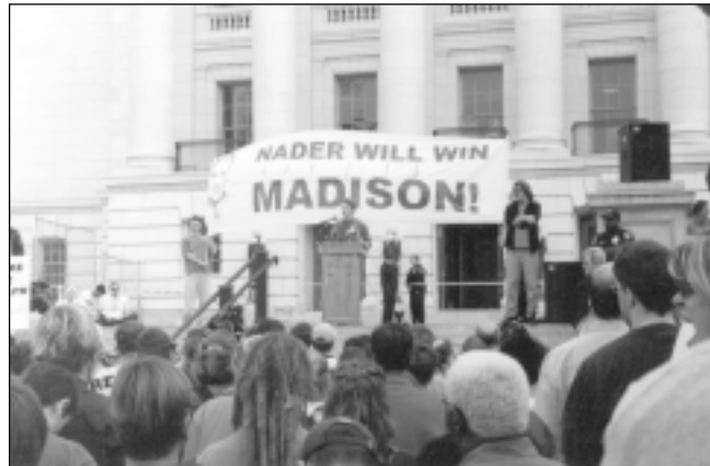
Revvng up the crowd at a Wisconsin rally (Nov 5, 2000)

~ My proudest accomplishment: The creation of the Coordinated Campaign Committee, the national party's elections committee, and service as that committee's first Co-Chair.